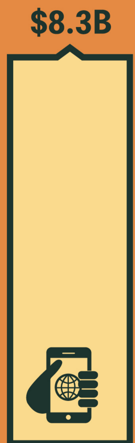
Web using mobile