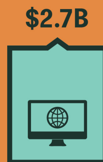
Web using Desktop